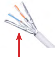
Foil shield in cable prevents unwanted alien crosstalk