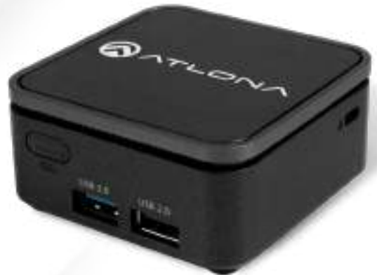
Third Generation Atlona Wireless Technology

Introducing the Atlona Wireless Audio Visual Environment (WAVE) and the AT-WAVE-101 , an innovative wireless presentation system designed for quick and easy content sharing from up to four PCs or mobile devices. The WAVE-101 is designed for effortless screen casting with iOS®, Android™, Mac®, Chromebook™, and Windows® devices.